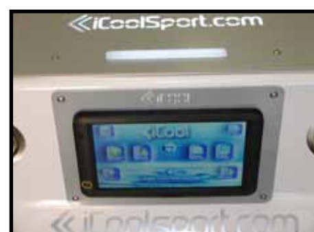
THE STATUS BAR LIGHT

Then the iCool owners logo screen will appear such as the screens below.