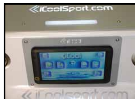
THE STATUS BAR LIGHT

Touching your personal logo screen (see below) will stop the bar flashing and show a steady white light to indicate that the systems check was successful and that your iCool is ready to use.