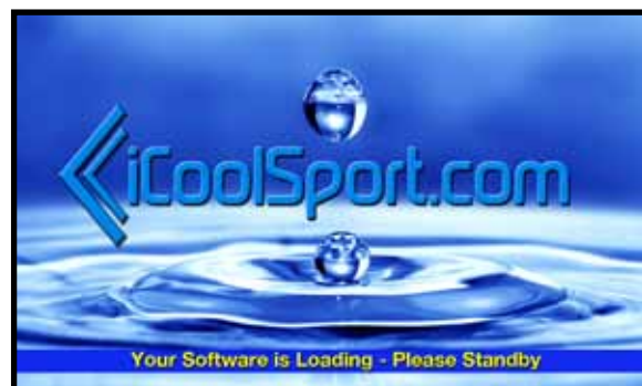
THE SOFTWARE LOADING SCREEN

When you turn on the power for the first time the system will load the latest software from its memory card and run a diagnostic self test routine. This will take about 20 seconds. During this time you will see this screen (shown at right) and then a BLACK screen.