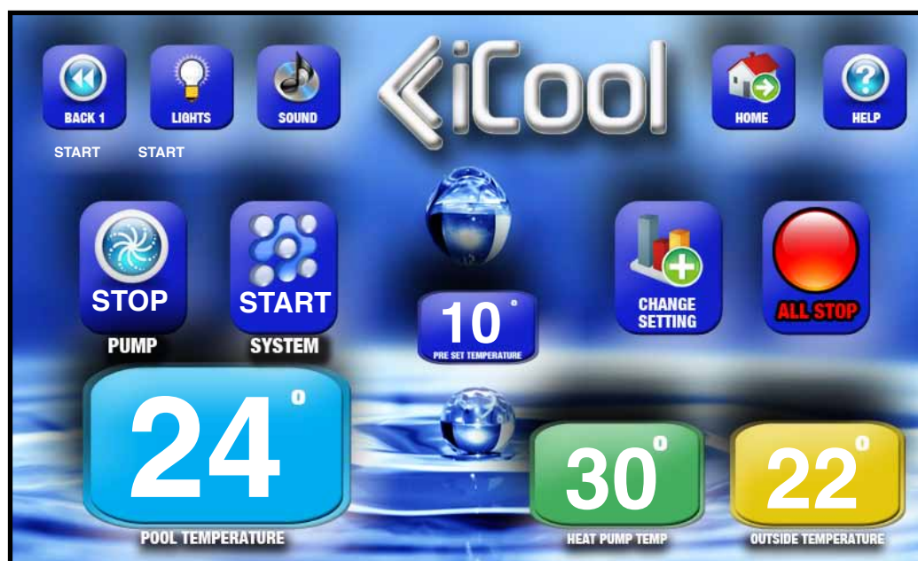
MAIN OPERATION SCREEN

Updates in Pdf format are published regularly on our website www.icoolsport.com