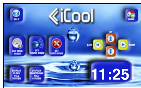
TIME SETTING SCREEN

Your iCool offers a number of very useful timing functions including a real-time clock, a countdown timer to time recovery and training sessions and a timer to shut down the system automatically at a predetermined time after use. To set up and use these functions touch the TIMER FUNCTION button on the home screen. You can reach this screen by using the BACK 1 button or the HOME button.