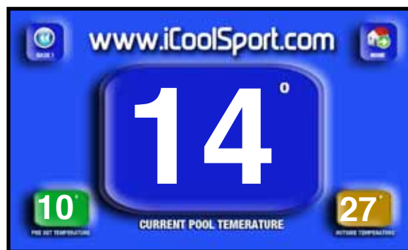
WATER TEMPERATURE FULL SCREEN