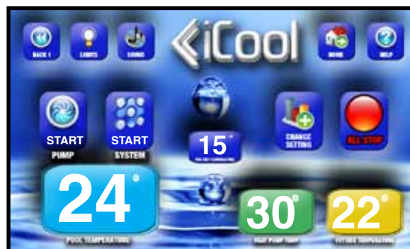
MAIN OPERATING SCREEN

Once the pool water temperature you want your iCool to cool to is showing, touch the START button. This takes you back to the main run screen which is the screen that you will use most of the time during normal operation.