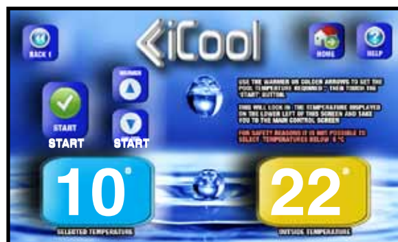
WATER TEMPERATURE SETTING SCREEN

Do not touch the START SYSTEM button until you are sure that water is flowing smoothly. If water does not flow smoothly within a minute, please check that the hose from the bottom of the pool is flat on the floor and no part of it is higher than the top of the water. Check that the water in the pool is higher than the inlet connectors on the iCool. If this does not correct the problem the system will sound an alarm and a red warning screen will appear with information about how to correct the water flow problem.